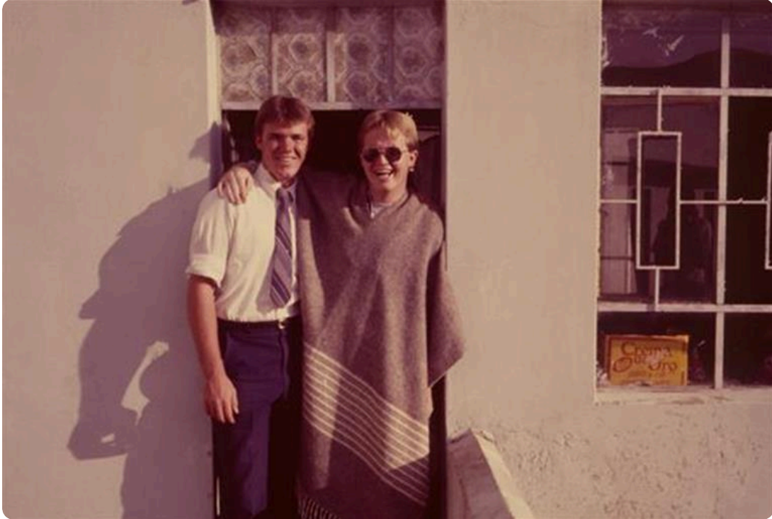
Elders Day & Hampton (after Brock's mission when he came back to "visit" :-)